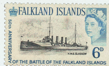
POLAR SALON LIBEREC 2022