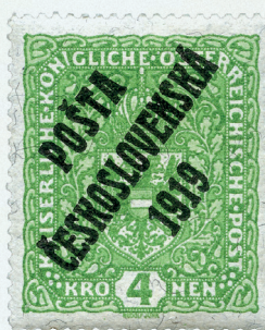
Austrian 4-crown stamp on granite paper with the POŠTA ČESKOSLOVENSKÁ 1919 overprint