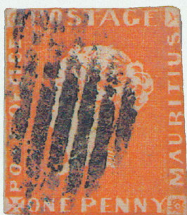
The Red Mauritius 1847