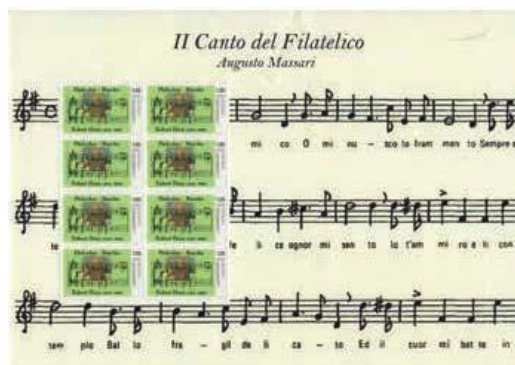
The Prix Massari - PHILCOLUX 2019

and dedication into setting the foundations for the Prix and launching it through friendly and effective links with similar specialized organizations, especially in France, Germany, Belgium, Luxembourg, and U.K., which in turn had members all over the world.