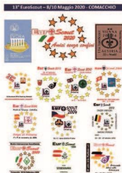
Postcard produced for EuroScout, due to take place in Comacchio in May 2020 but postponed until September 2022

EuroScout involves exhibits of stamps and postal documents and philatelic literature, as well picture postcards, vignettes and labels, and memorabilia. Anyone interested may apply for exhibiting and admission to the exhibition is free. Several participants wear their own Scout uniform with the special commemorative scarf produced on the occasion. Exhibitors are prepared to present their exhibits proudly to the public. In addition to the philatelic talks an intense social programme characterized this event.